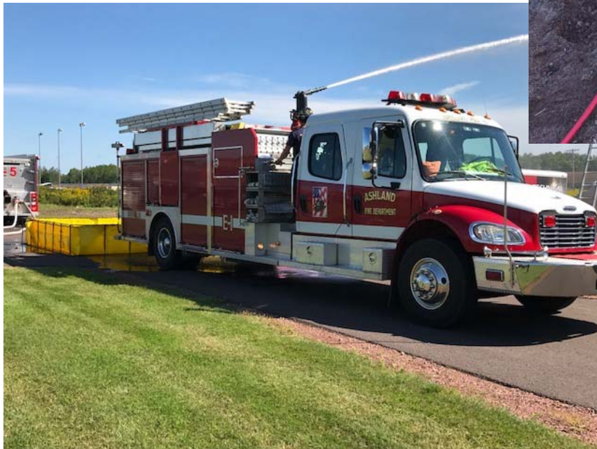
Drafting from a static source to simulate rural fire operations.