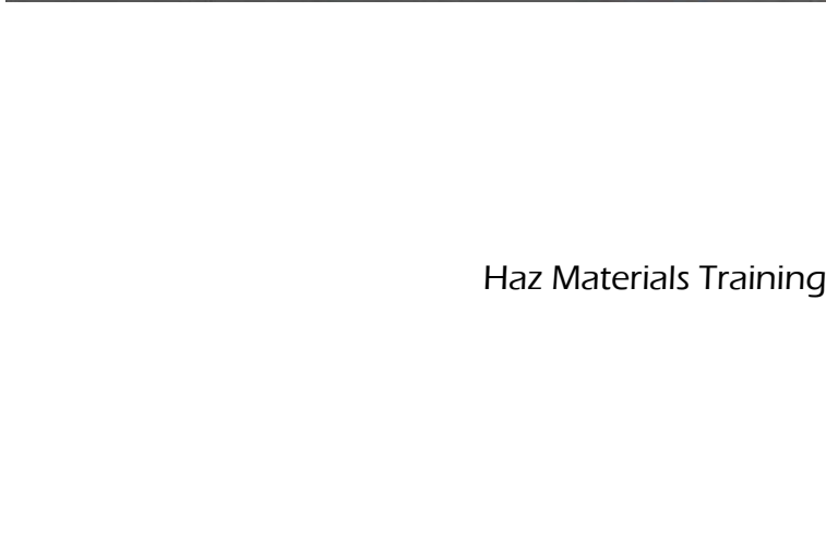
Haz Materials Training