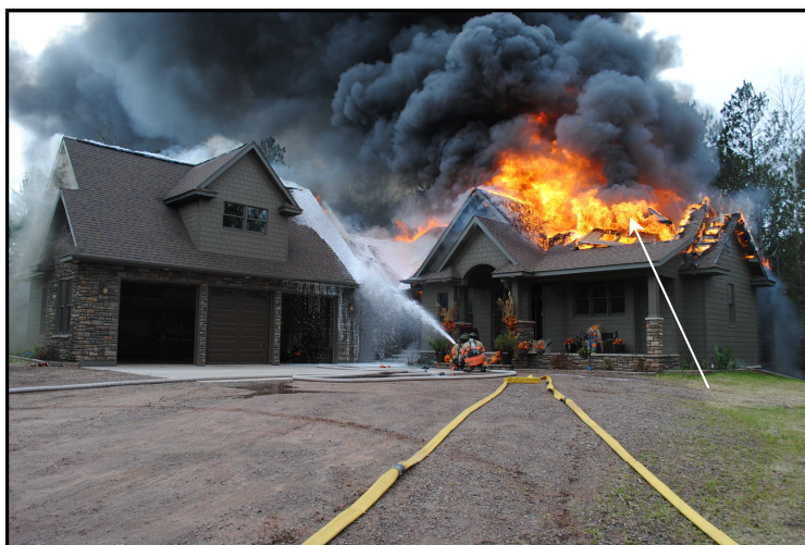
October 31, 2010, Structure Fire in the Township of Eileen, 68455 Timber Creek Rd. Picture was taken within minutes of arrival.

In conclusion, I believe 2011 will be even be more challenging than ever. Outsourcing the EMS billing by July 1st is a priority. Mutual-aid agreements, existing or non-existing, will need to be renegotiated with the surrounding communities. A decision to replace the department's aging ladder/tower apparatus needs to be addressed sooner than later. The denial of the FEMA Fire Station Construction Grant was disheartening to all. The need to build a new fire station has not gone away, and the chance that additional funding will become available in the future is unrealistic. In the past 15 years, there have been several plans and concepts discussed and presented. Currently, there is site and a plan on the shelf and the time has come to make a serious decision and commitment to either proceed with the current set of plans or move in a new direction, such as; a Public Safety facility.