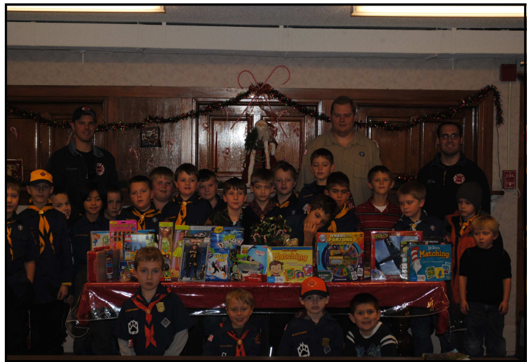
Local Cub Scout Troop dropping off toys

Ashland Fire Fighters Annual Toy Drive was a huge success. Thank you to all the volunteers, local businesses, and citizens of the area who helped with this years toy drive. Thanks to the donations of toys and monetary gifts the Ashland Fire department was able to provide toys for 670 children in Ashland and Bayfield Counties. The toy drive provided toys for 193 families and 399 children in Ashland County and 122 families and 271 children in Bayfield County. Without the generous donations made the annual toy drive would not be possible. Again the Ashland Fire Department would like to thank all who helped.